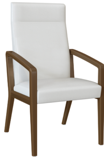
Model: MDAP11 24W 27D 43H 20SW 18.5SD 19SH 26AH

The Modena Patient Chair with Flex Back is designed with a flex frame connecting the seat to the back. This frame enables a modest amount of flexibility in the back only, which adds a level of comfort while waiting. The seat, arms and legs remain stationary providing ergonomic support as the user changes position while unique tapered arms with a faceted edge facilitate ingress and egress. This chair works well in healthcare waiting spaces and patient rooms. It has wallsaver back legs to ensure the walls remain in pristine condition.